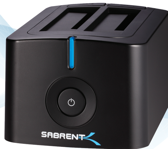
USB 3.0 SATA 2.5" & 3.5" DUAL BAY HARD DRIVE DOCKING STATION

The Sabrent Dual Bay Hard Drive Dock enables you to access and transfer data between your computer and two hard drives simultaneously, or between the two hard drives themselves. Moreover, you can also use the Sabrent Dock to clone hard drives offline at maximum speed. Plug and play support for both 2.5" and 3.5" SATA, SATA II, SATA III and SSD HDDs (up to 3TB per bay). USB 3.0 Interface supports super speed data transfer up to 5Gbps (reverse compatible with USB 2.0). Especially ideal for system integrators, administrators and computer technicians.