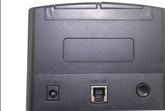
POWER INTERFACE (DC IN) USB PORT COPY BUTTON